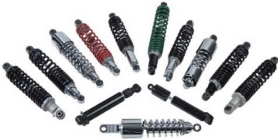
76 Series Shock